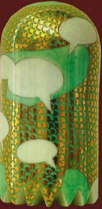
JESSE SMALL, Ghost 8, 2007, porcelain, 6.75 x 3.25 x 3.25 inches