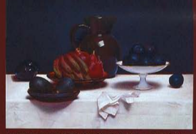
MARTHA MAYER ERLEBACHER, Night Still Life , 2003, oil on canvas, 30 x 32 inches

Commencing with its celebrity-studded opening gala January 23, the L.A. Art Show is one of the country's most prestigious art expositions. Significant works — spanning history's finest artists, including Ansel Adams and Picasso, to cutting-edge contemporary from some of today's emerging talent — will be available for purchase.