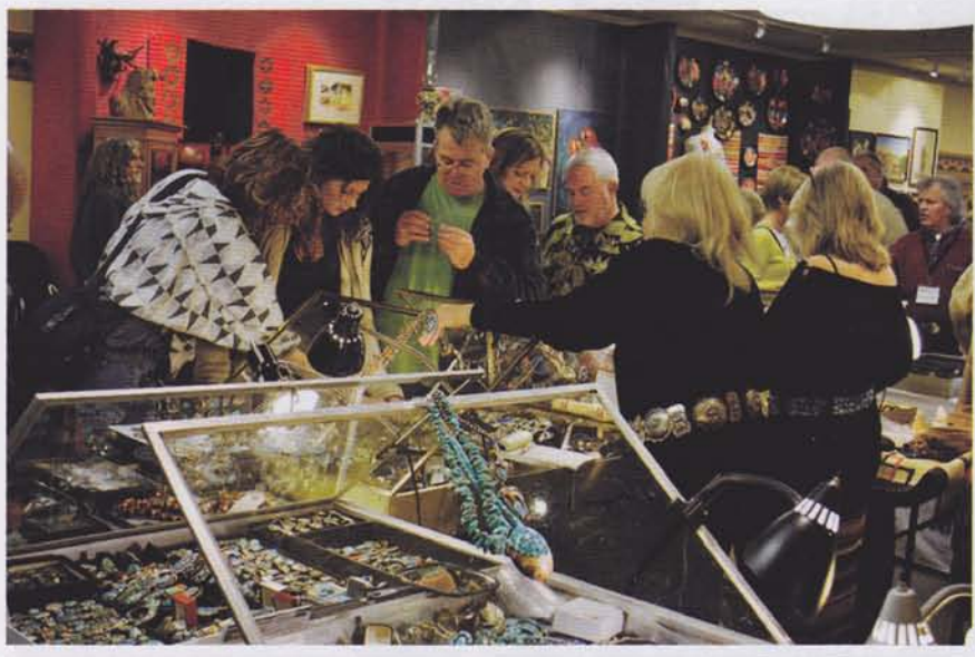
Pottery, basketry and jewelry pieces are among the one-of-a-kind works available at the Marin Show .

Marin Show: Art of the Americas marks 29 years with an array of antique and contemporary works.