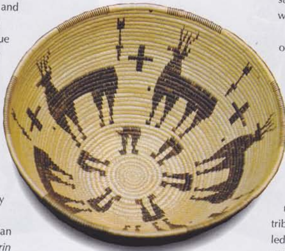
Deer Basket, Panamint tribe of California, c. 1920, 8" (diameter) x 3".

director. "Native American art and craft is extraordinarily beautiful and the diversity of the Marin Show showcases the creativity and