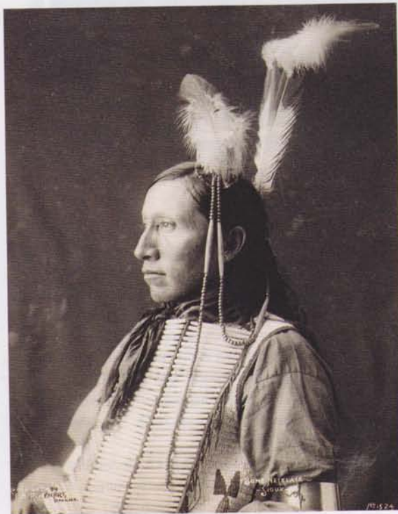
Sioux Indian with bone necklace, c. 1890, original photograph, Omaha, NE, 1899, No. 524.