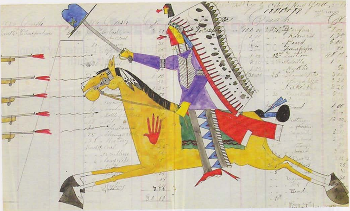
Michael Horse, Counting Coup , watercolor painting on ledger paper, 18 x 22"